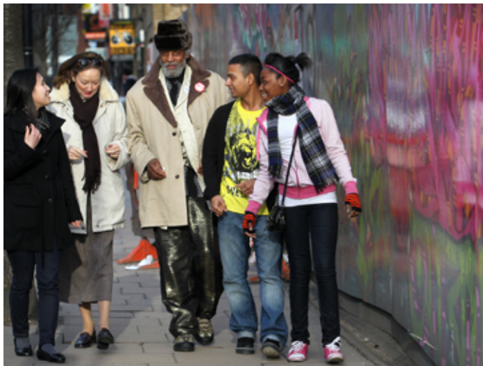
Legacy Youth Panel meet the Senior Bees

For more information visit: http://designafuturepark.tumblr.com/